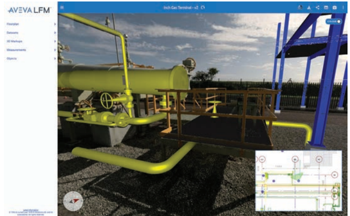
BubbleView with Objects

Not only is AVEVA LFM NetView hosted on AVEVA Connect, it can be hosted on-premise on a user's company network as well.